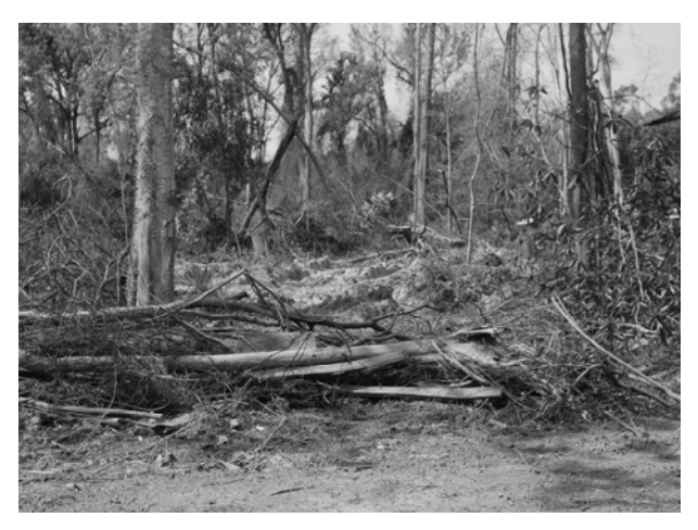
Gustav debris to be chipped as mulch.

The downed trees in the portion of Burden Woods that borders Wards Creek were not harvested and will be allowed to remain in place. No attempt to control invasive species or prepare the forest floor for new seedling growth in this area will be made. This area can serve as a control demonstrating different management practices that can be used after a destructive hurricane providing information for future urban forest management.