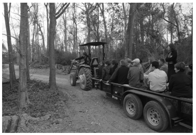
Hayride through Burden Woods viewing Hurricane Gustav's devastation.

On March 4<sup>th</sup> the Burden Horticulture Society together with Baton Rouge Green hosted a lovely reception for the Junior League and Forum 35 volunteers whose hard work made the Trees & Trails at Burden Center possible. The official opening of these trails, which was planned for October 2008, was delayed by Hurricane Gustav. The celebration acknowledged the volunteer's accomplishments and contribution to Trees and Trails. The event included a hayride through the woods to show the devastation caused by the storm. The volunteers were thanked for their work and were assured that their efforts were not in vain as a new trail opening date is targeted for October 2009 which includes plans for a new pavilion with restroom facilities and a picnic area so that it can be used as an outdoor classroom for visitors.