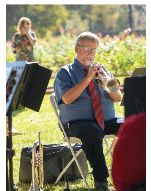
The Civic Orchestra of Baton Rouge playing near the Rose Garden.