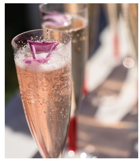
Event signature cocktail: The Rambling Rose.

Please join us to enjoy fall in the gardens with food and beverages, live music and entertainment. Purchase your tickets today for the Wine and Roses Rambler 2022 to be held on Sunday, Nov. 13 from noon to 2 p.m. Nonmember tickets are $100, and member tickets are $90. The proceeds will support the wonderful education programs and activities of the Botanic Gardens at Burden.