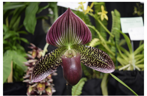
A Fred's Triumph Orchid.