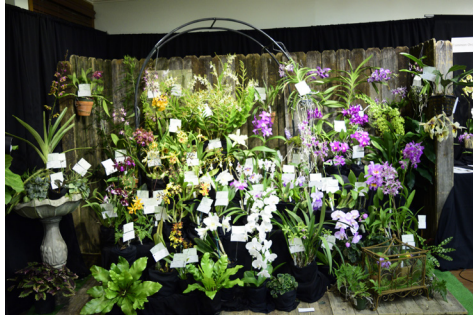
Baton Rouge Orchid Society took first place with this breathtaking display.