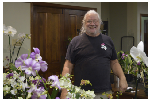
Spring Orchids was just one of our four vendor booths at the Orchid Show & Sale.