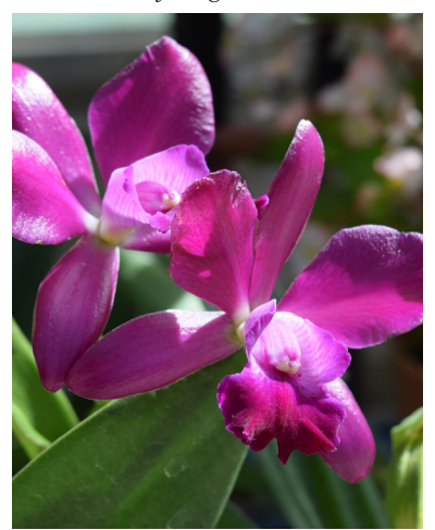
A Cattleya orchid shines in the light.