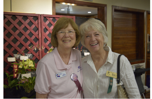
We are so grateful to ALL the volunteers and Orchid Society members who made this event happen!