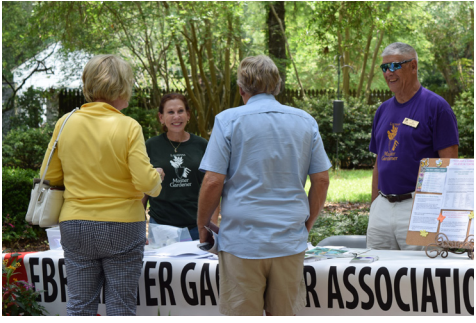
EBR Master Gardener Plant Health Clinic in Windrush Gardens.