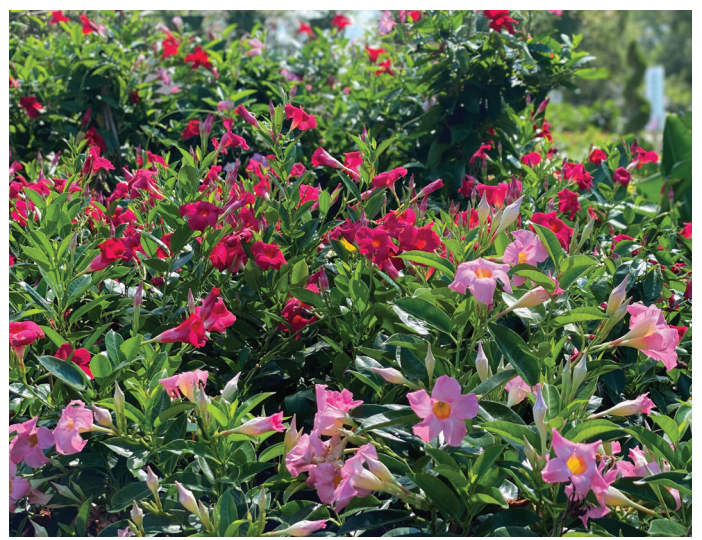
Mandevilla comes in a variety of beautiful colors, including light to dark pinks, reds, yellows and white.

Hummingbird bush ( Hamelia patens ) shrub grows to 6 to 10 feet tall, and blooms are red-orange, tubular flowers that last from early summer to late fall. It performs best in full sun. Try Lime Sizzler, a Louisiana Super Plant.