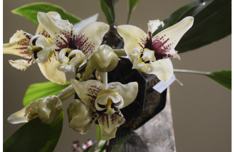
This mulit-award-winning orchid only blooms for three days out of the year.