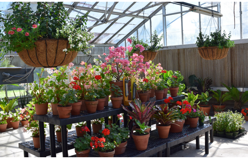
A view inside of the glass house.

The glass house is open daily from 8 a.m. to 4:30 p.m. During your next visit to the gardens, be sure to stop in and admire the collection.