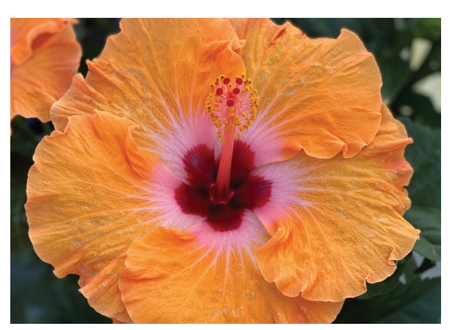
Tropical hibiscus comes in single- and double-flower forms in nearly any color combination imaginable.

Firecracker plant (Russelia equisataformis) is an evergreen shrub with red and yellow