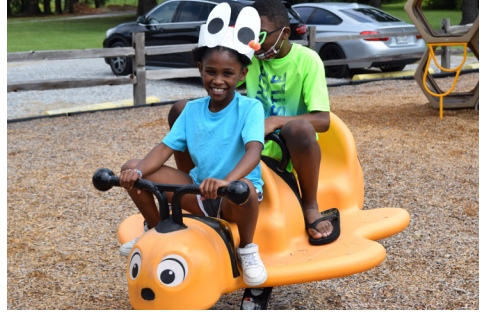
Children play on bee Pollinator Playground after a bug-themed Story Time in the Garden with the Junior League of Baton Rouge.