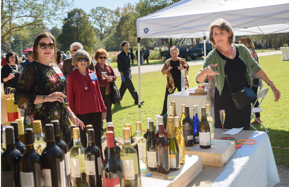
Guests taking a chance to win a bottle at the wine toss.