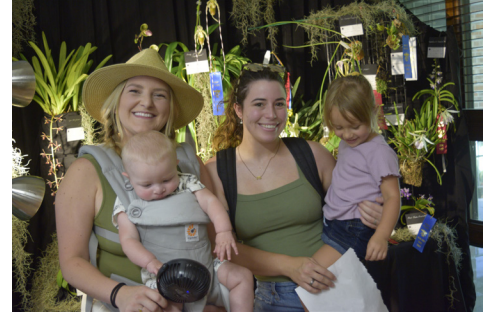
These young mothers had a great time checking out the orchid displays!