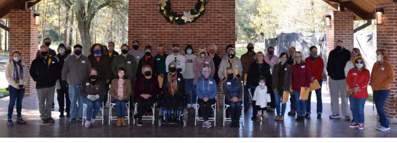
2020 graduates of the East Baton Rouge Parish Master Gardener program.