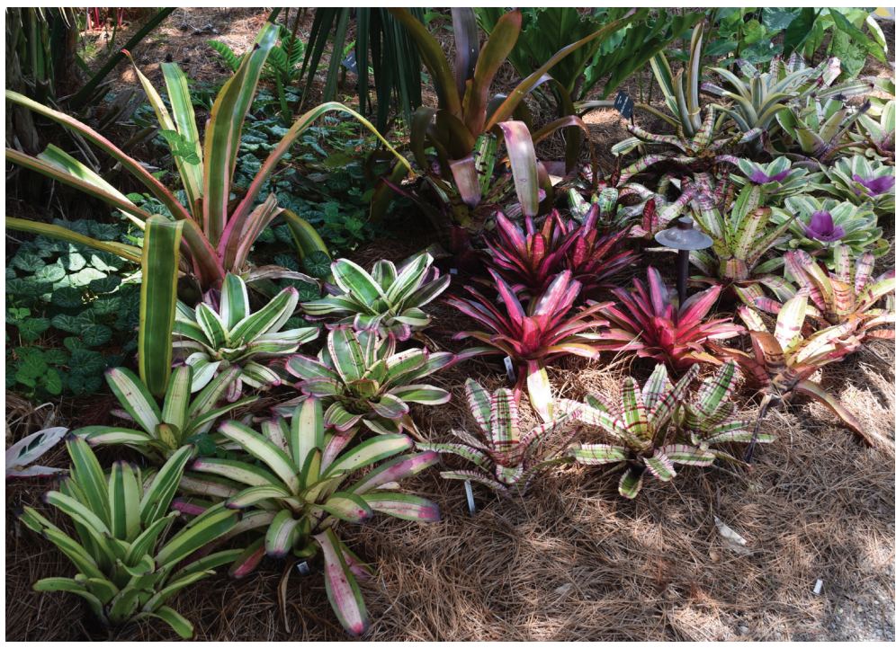
Mix of variegated bromeliads from breeder Chester Stotak

Aechmea is a vase-shaped bromeliad that gets its name from the Greek word for spear, referring to their spear-shaped inflorescence, or flowering structure. Most Aechmea have green foliage, but some, like A. blanchetiana, have beautiful rosy hues ranging from oranges and yellows to brilliant reds and merlots! These bromeliads will like shady areas of your yard and will also do well on your patio. The only real exception would be A. blanchetiana, which can tolerate morning and midday sun. Billbergia, also known as Queen's Tears, is a bromeliad that many will already be semi-acquainted with in south Louisiana. Treated as a passa-along plant for many years, breeders have been making strides with coloring and flowering, offering new looks to this old classic. The flutelike shape is complemented by the