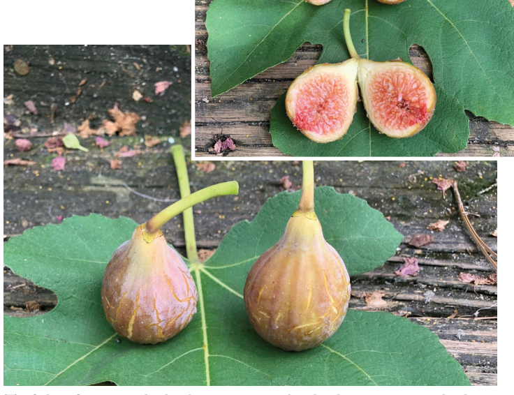
The Celeste fig is a popular heirloom variety used to develop new varieties by the LSU AgCenter.

389-3055 or email him at RuHarris@ agcenter.lsu.edu.