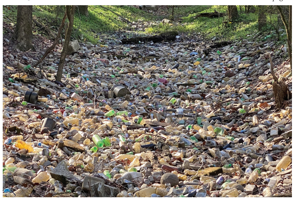
Trash in a borrow pit at Burden