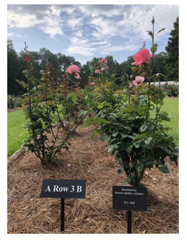
Rose Garden row three maintained by M.L. Bell.