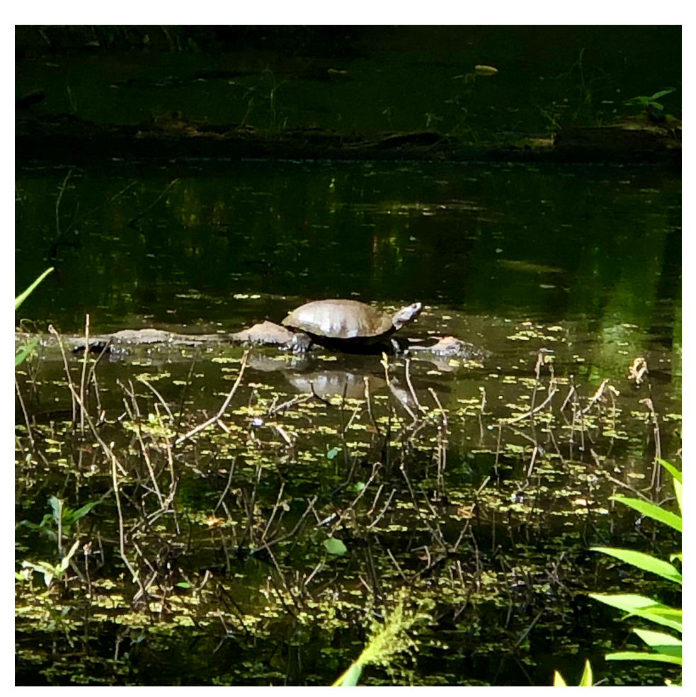
Pond slider turtle in the lake at Windrush Gardens.

The Birding at Burden webpage that I developed during the first couple of months of this year has links to websites, apps, books and other valuable information for every birder's level of experience. Last year I created a Citizen Science webpage that has information with links to projects individuals of all ages can tackle in their backyards, neighborhoods and communities.