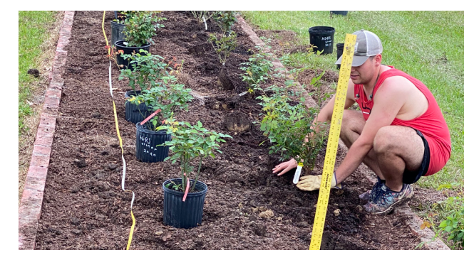
Summer intern Carson Parker plants rose bushes.