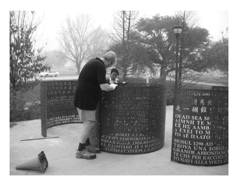
Artist James Sanborn assembles artwork that now appears on the terrace of the Energy, Coast & Environment Building.

Radiance was acquired through the state public art bill specifying that one percent of a new state building's construction budget can be designated for public art. The ECE Building, completed in 2003, was the first new building to fall under this public art bill.