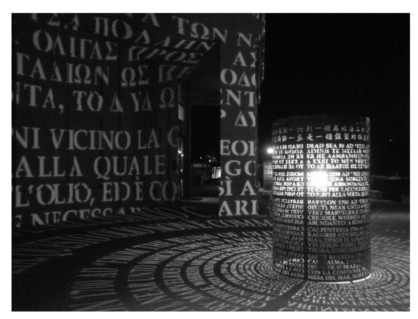
Radiance by James Sanborn.