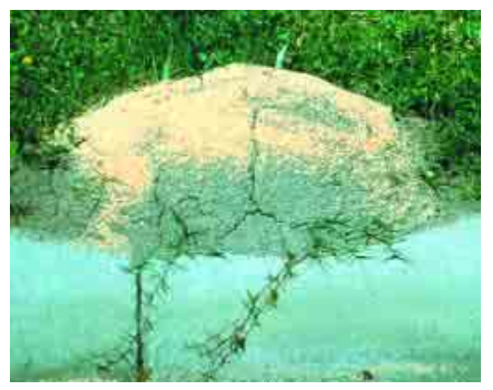
Do not apply more product than specified on the label. Water it properly.

To treat a single mound with a granular product, measure the recommended amount in a measuring cup and sprinkle it on top of and around the mound. Do not disturb the mound. If the label specifies to water in the insecticide, use a sprinkling can and water the mound gently to avoid disturbing the colony. Several days may pass before the entire colony is eliminated.