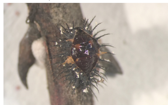
Figure 6. Pupa of Chilocorus cacti.