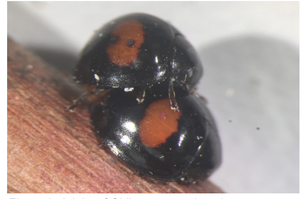
Figure 8. Adults of Chilocorus cacti mating.