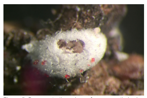
Figure 5. Damage to the ovisac of crape myrtle bark scale caused by Chilocorus cacti larva.

Several approaches can be used to enhance the presence of C. cacti in the landscapes. First, use insecticides with low toxicity to manage the crape myrtle bark scale. Second, insecticides can be applied during the time of year when lady beetles are less abundant such as winter. Additionally, planting flowering plants can provide pollen as an alternative food to attract this lady beetle or prolong its activity in the landscapes.