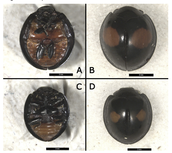
Figure 7. Comparison of adults of Chilocorus cacti and Chilocorus stigma. Pictures (A) and (B) are dorsal side and ventral side of C. cacti; (C) and (D) are dorsal side and ventral side of C. stigma. The color of the ventral side (A and C) and the size of spots on elytra (B and D) are different.