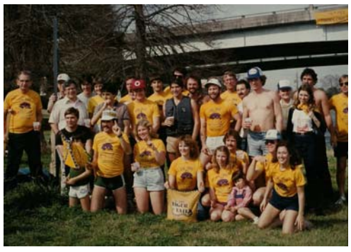
ASCE Student Chapter Concrete Canoe Races 1981