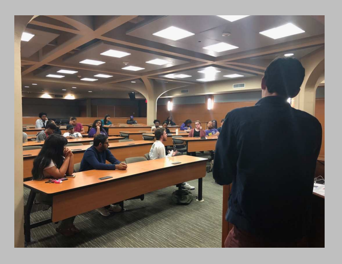
A panel discussion on Cultural Appropriation hosted by the Society of African and African American Studies '