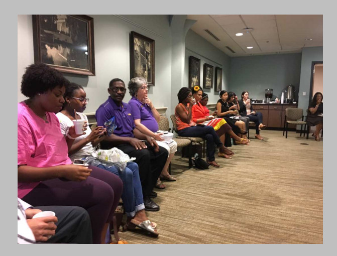
A Campus Diversity and Inclusion Lecture Series for Faculty, Administration and Staff