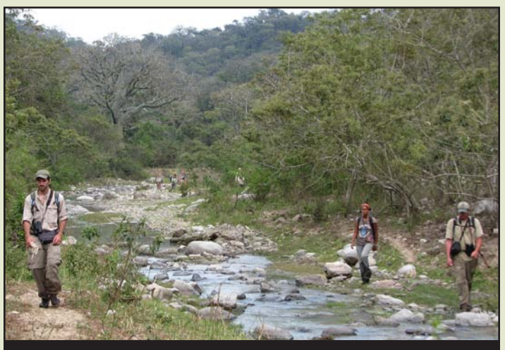
LSU alumni Jacob Saucier , Phred Benham , and Sheila Figueroa from CORBIDI hike the trail to Cerro El Platano camp.

Tumbes' diverse range of habitats (deciduous forests, arid coastal scrub, dry foothills, coastal mangroves, and montane humid forest) resulted in an exciting and everchanging aspect to the expedition. Once established, the expedition team was eager to go about recording and collecting representatives from the local avifauna. The area had an impressive bird roster that included a substantial component of endemic specific and subspecific taxa, such as the Rufous Flycatcher (Myiarchus rufus) and Collared Antshrike (Thamnophilus bernardi) of the drier foothills, and mangrove specialties such as the distinct Tumbes form of the Clapper Rail (Rallus longirostris) and Rufous-necked Wood-Rail (Aramides axillaris). The more humid deciduous forests of the Amotape Mountains were home to other feathered gems such as the Gray-and-Gold Warbler (Basileuterus fraseri), Henna-hooded Foliage-Gleaner (Hylocryptus