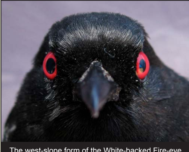
The west-slope form of the White-backed Fire-eye ( Pyriglena leuconota ). The western populations of certain species are poorly represented in museums.

mentation of species previously observed but not collected in Peru. Moreover, one species collected was a new addition to the known avifauna for the country: the Rufous-tailed Hummingbird ( Amazilia tzacatl ). The specimens themselves have been divided evenly and will be housed at CORBIDI in Peru and LSUMNS here in the United States. Specimens from such an endemic-rich area will be a solid contribution to the diversity of taxa represented in ornithological collections. The findings of the expedition are also an invaluable asset in emphasizing the importance of conserving such unique ecosystems as those found in Tumbes. The expedition was also a great adventure for its participants, veteran and novice alike, who were filled with priceless experiences and memories that will last a lifetime, from a truly unique place in tropical South America.