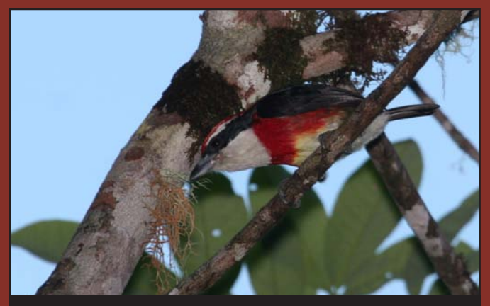
A new taxon of Capito barbet discovered by the team in the Cerros del Sira of Peru.

In the isolated savannas of the Gran Pajonal, we found a unique community of grassland birds that included some species isolated from their nearest known populations by almost 400 miles. The cloud forest of the Cerros del Sira harbored a surprising diversity of Andean birds, including a number of rare and poorly-known