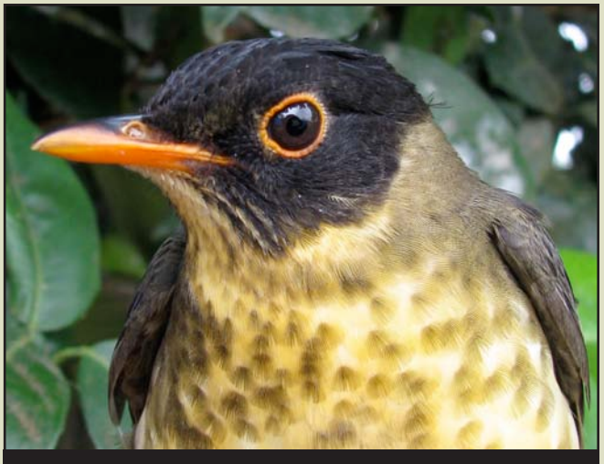
The great singer Spotted Nightingale-Thrush ( Catharus dryas ), was restricted to the more humid areas of the Tumbes department.