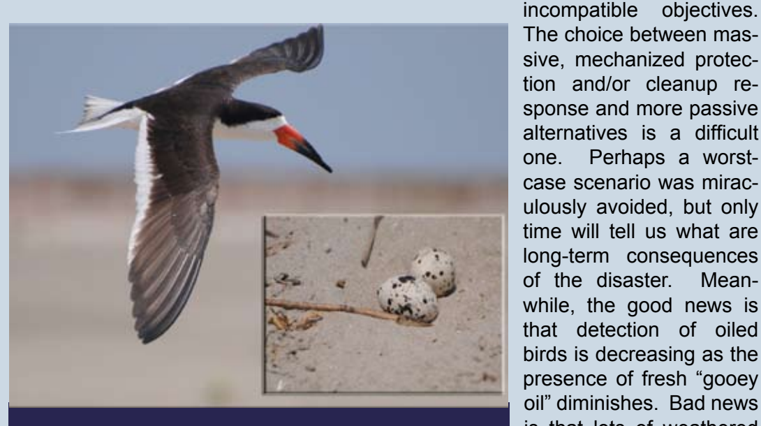
Figure 4. Black Skimmers typically nest in small to large colonies on the State's barrier beaches, however this pair had an isolated nest (two eggs, inset) found 19 May 2010 on Trinity Island.

Over the weeks and months since 20 April. Steve and Donna have wit-