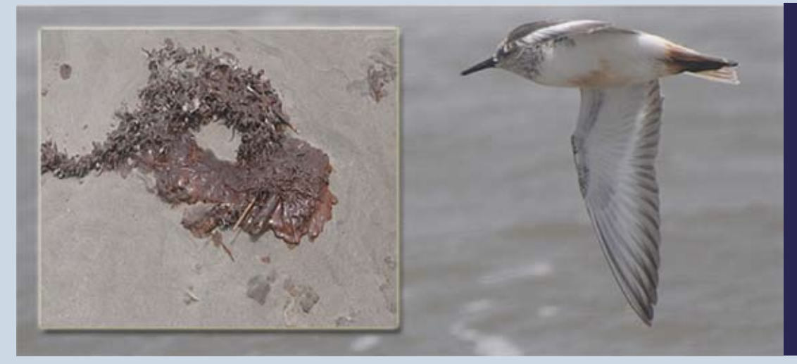
Figure 1. Only a relatively small amount of "gooey oil" (see insert of oily sargassum) had washed up on the beaches of Big Timbalier Island on 14 May 2010, yet 10% of the Sanderlings encountered, such as this one with "moderate oil" stain ing its underparts, were impacted.

As the Deepwater Horizon disaster unfolded, the American Birding Association (ABA) created the ABA Gulf Coast Fund (https://www.aba.org/donate/gulf.php) and began allocating 95% of donations back to organizations involved with coastal bird research and conservation in the affected Gulf Coast states. In consultation