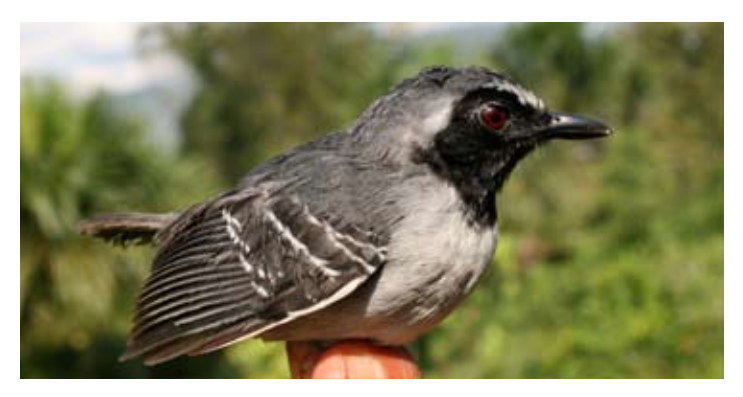
Myrmoborus myotherinus (Black-faced Antbird) is a widespread Amazonian species that is a focal species for several Museum of Natural Science research projects.

We set up camp at a hydroelectric station a few miles south of town, with the support of the Ashaninka community Canuja and the Electro Ucayali power company. The concrete aqueduct of the hydroelectric plant stretched several miles up into terra firme forest, and we promptly positioned our mist nets and began making audio recordings and collecting. An ongoing severe