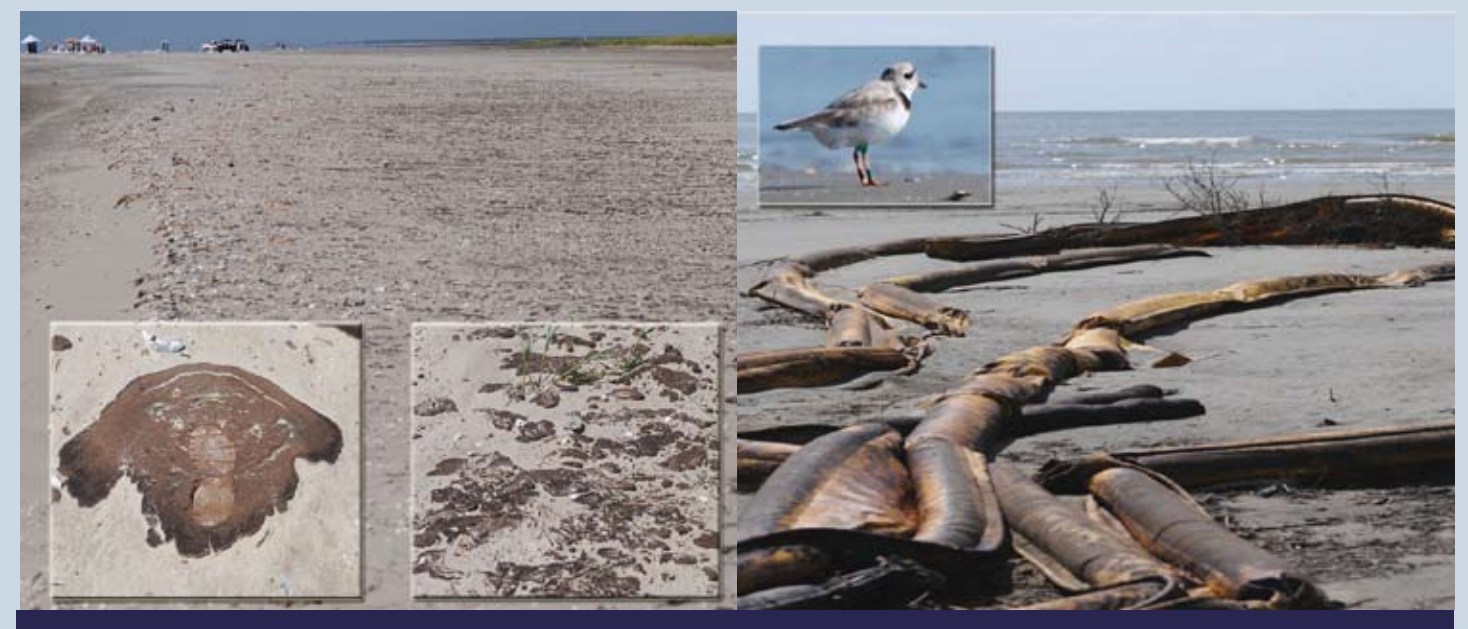
Figure 2. Between our visits on 4 Aug and 16 Sep 2010, Whiskey Island received a substantial amount of "new" oil. Here looking at the single cleanup camp on the west end of the island on 16 Sep, the beach in front is littered with weathered oil (inset on right). Oil pancakes were extensive and varied in size from pizzas (left with DLD's shoe print for scale) to pebbles.