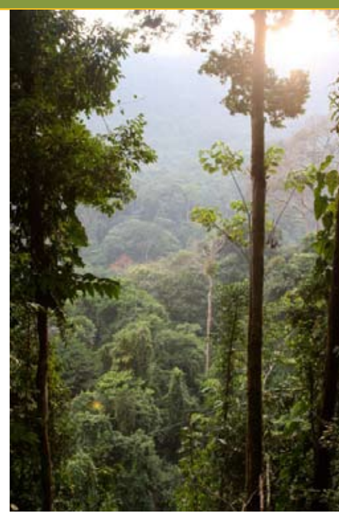
Foothill forest on the lower slopes of the Gran Pajonal above San Juan de Dios.

friaje (a cold front from the south) forced us to don jackets and hats, but it didn't hamper our research efforts. Perhaps the biggest avian surprise came on 20 July. While crossing a bridge over a rushing stream, I spotted a flash of red to my left. Raising my binoculars, I was stunned to see a Fiery Topaz ( Topaza pyra ) hovering low over the water. This is a range extension of at least 500km for this species, and perhaps the southernmost locality on record anywhere. We found that quite a few individuals visited the stream here, and we were ultimately able to collect two males.