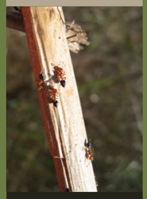
Ants on a stem of marsh grass are but one species dependent on the salt marsh environment.