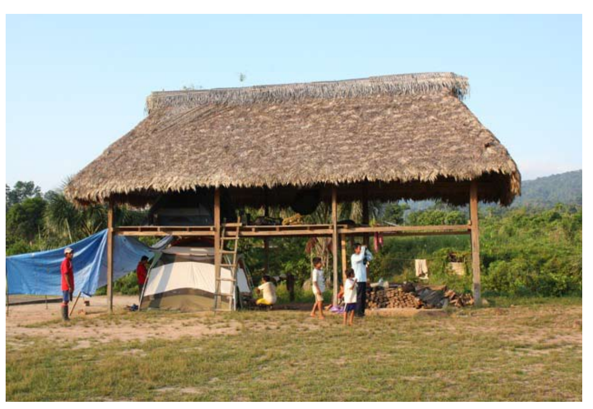
The community of San Juan de Dios generously provided the team with a thatched shelter in which to stay and work.

While we were only in Peru a month, and only spent a little over two weeks in the field, we managed to accomplish a lot. We collected some 310 specimens and accompanying tissue samples, made hundreds of recordings (some of which are now accessible on the Macaulay Library website: www. macaulaylibrary.org), and gathered valuable data on bird distribution. Perhaps even more importantly, we established local contacts and collaborations that will serve us well during upcoming field work in the region.