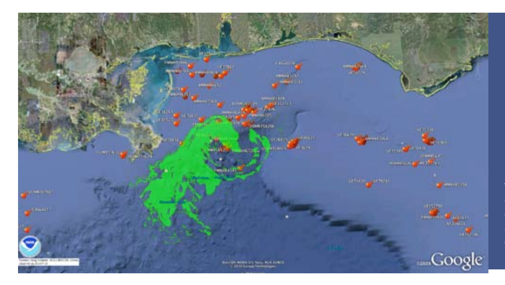
DEPTHMAP display from July 17 for Halieutichthys intermedius (Ho et al., in 2010) a batfish discov ered in 2010 in the region directly affected by the Deepwater Horizon oil spill.

used, Corexit 9500 and 9527, degrade quickly in warm waters when exposed to sunlight: it is not known how these chemicals break down in the dark and cold deep ocean. There is also no way of dealing with subsurface oil: oil at the surface can be skimmed and burned, treated and broken down. Even if we could treat subsurface oil, it would be difficult to find. We have inadequate tools for discovering oil floating in the water column as either tiny suspended microdroplets or as dense deep-sea plumes. We frankly do not know how long oil combined with dispersants will remain in the environment. We do know that the combination of high atmospheric pressure and darkness certainly allows the oil to be maintained in the deep sea much longer than it can in warm surface waters.